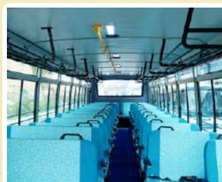
Spacious Area for Ease of Movement