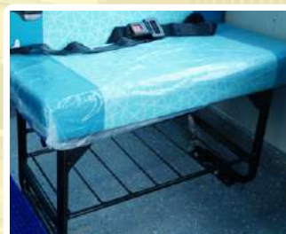
School Bag Rack