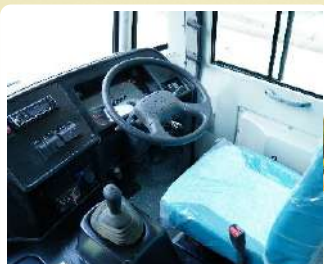
Aesthetically designed Drivers Cabin with Smartly placed controls