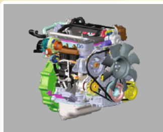
Equipped with Efficient BS-VI Engine