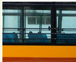
Window Guard Rails