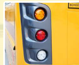
LED Rear Lamps