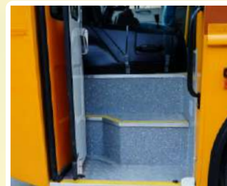
Low Step Height