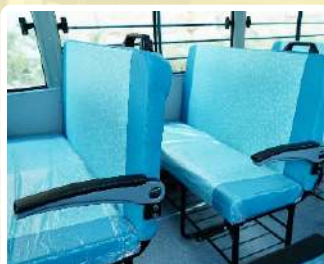
Anti- Bacterial Laminated Fire Retardant Upholstery